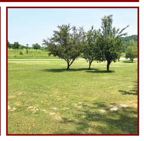
Located 4 miles east of Marshall, Ohio at 5531 Carmel Road off SR 506.